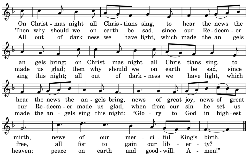
Words and Music: Traditional English Carol