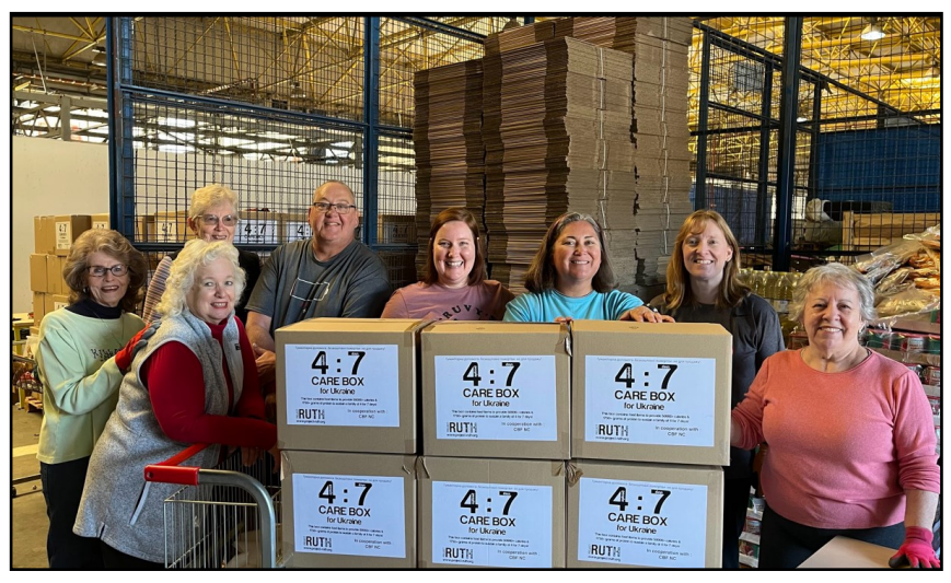
Romania Mission Immersion Team