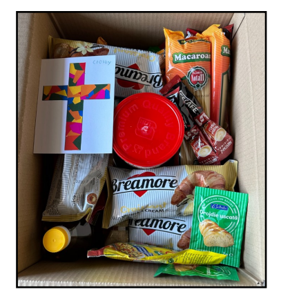
Cards from GAs and RAs