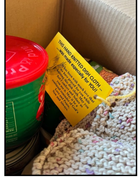
Dish Cloths from Prayer Shawl Group