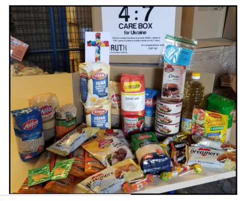
Care Box Contents