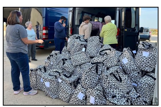
Winter Bags for Refugee Camps

2 kg of long grain white rice 1 kg of red lentils 500g of buckwheat 1 liter of oil 2 large packages of dried soy granules 120g of cocoa powder 200g of dehydrated vegetables Active dry yeast (2 packets)