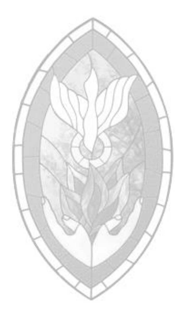
June 5, 2022