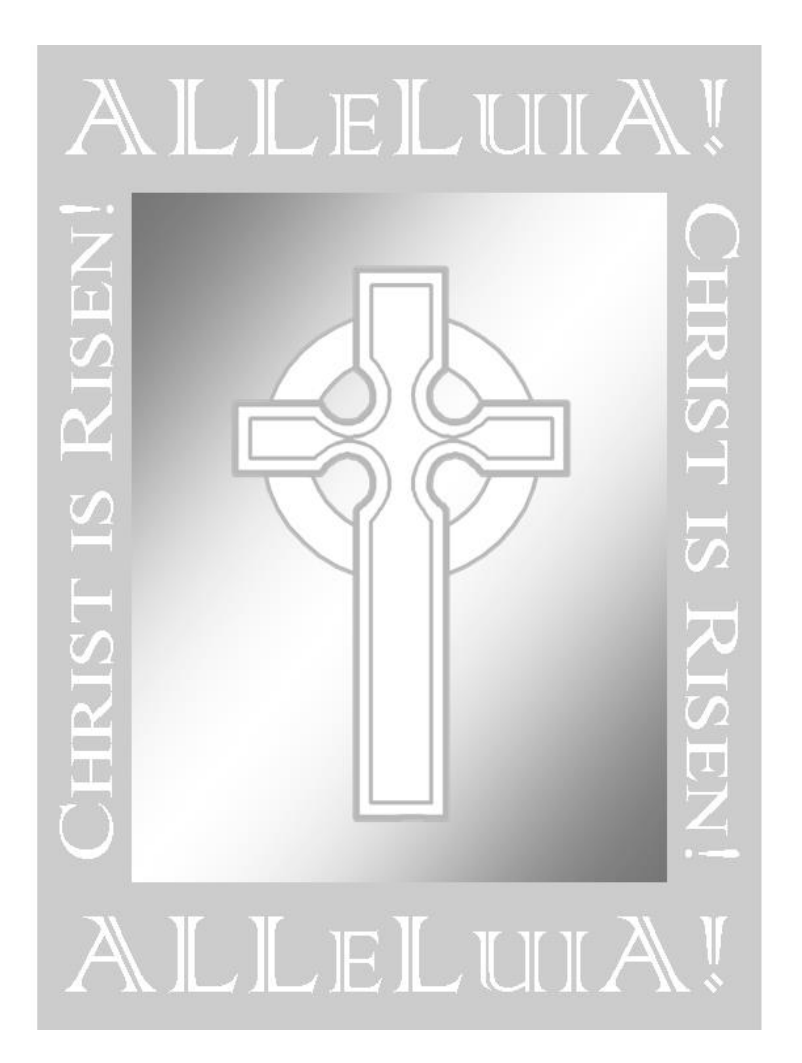
May 1, 2022