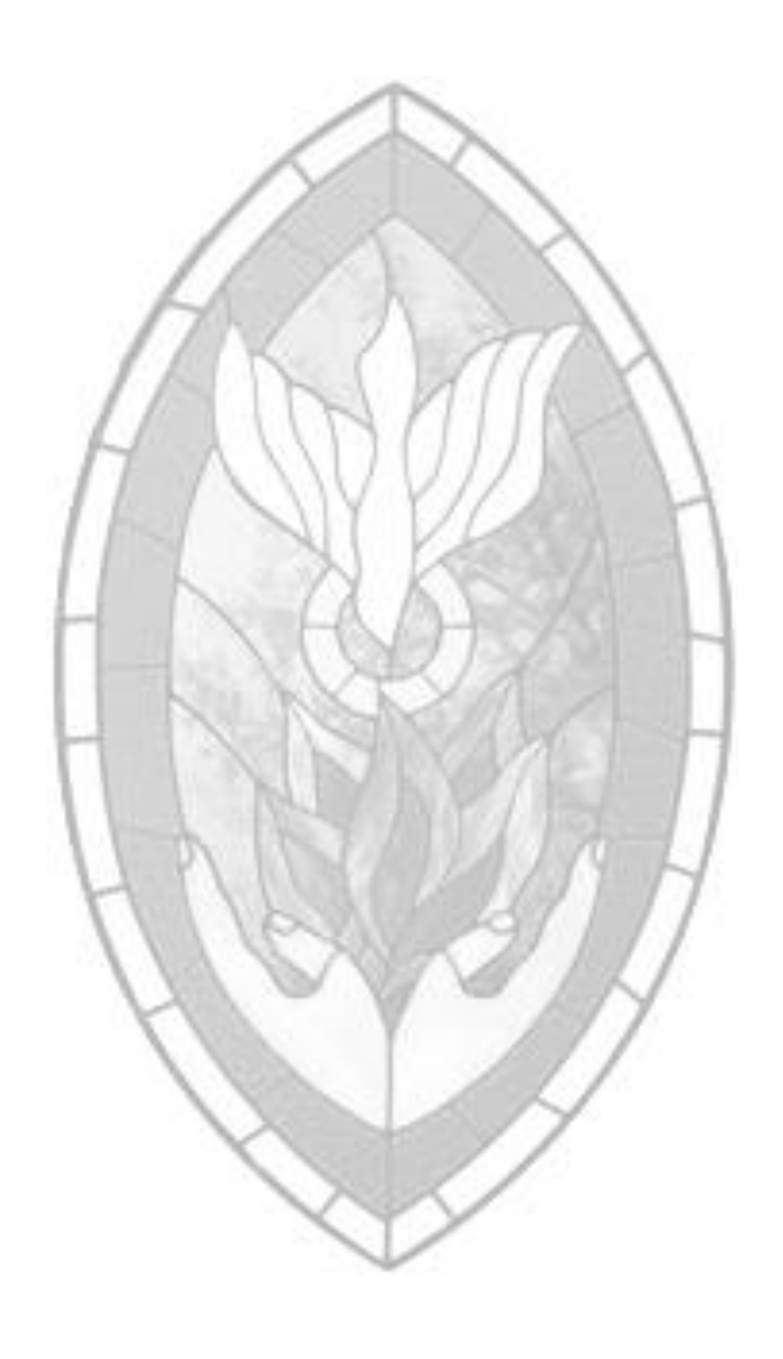
May 23, 2021