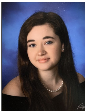
Catherine Carter Enloe High School