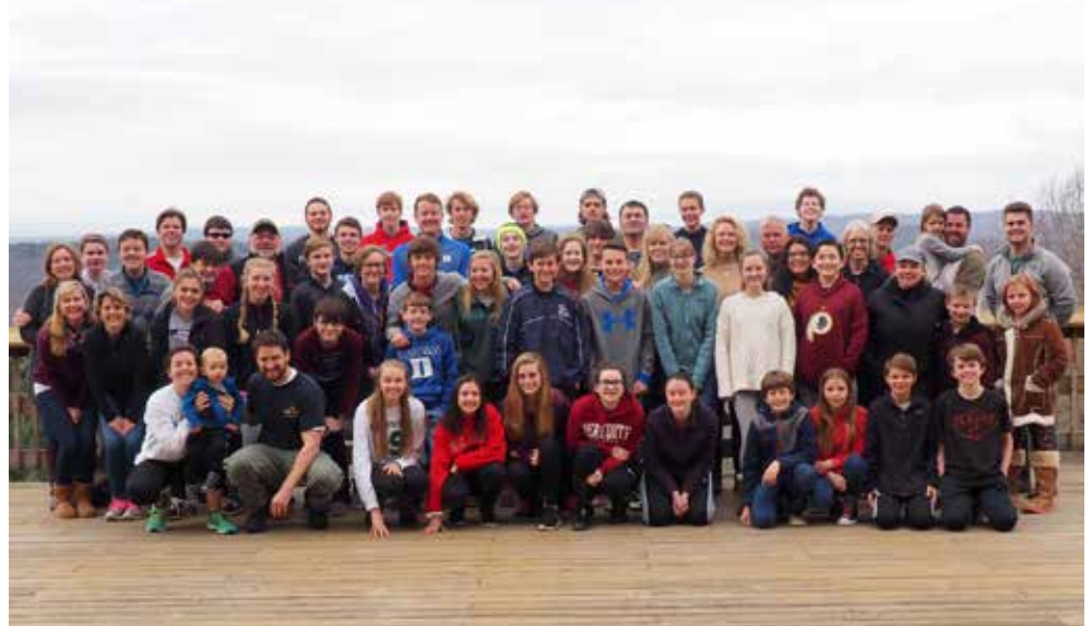
A group of 64 from FBC traveled to West Virginia for our annual ski trip. Skiers of all ages enjoyed a day on the slopes, cooking and eating together, and worship surrounded by the beautiful Appalachian Mountains. Thanks to everyone who made the trip possible!